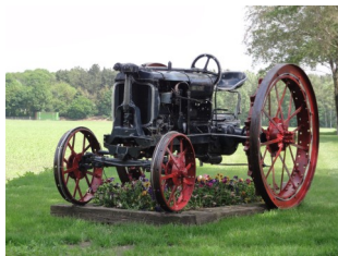
Exhibit your antique tractor at the Fair